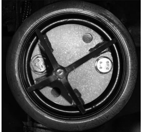
Image left is a top view of the cone fitted on the RH side of the vehicle, again note which holes are used

Image left is a top view of the cone fitted on the LH side of the vehicle, note which holes are used.