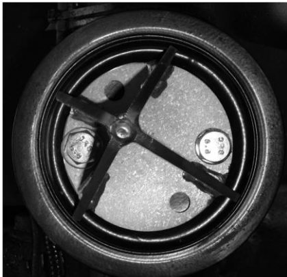
Image left is a top view of the cone fitted on the LH side of the vehicle, note which holes are used.

Place the cone onto the spring seat using the M10 x 30mm bolts and washers through the appropriate holes as indicated below and use a washer and Nyloc nut on the back (if applicable).