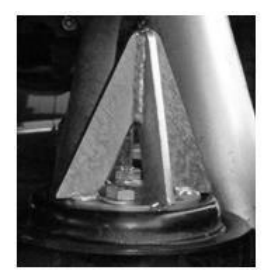
Image left is a top view of the cone fitted on the RH side of the vehicle, again note which holes are used

Note: the cone is designed to sit towards the rear outside of the spring, this aids relocation.