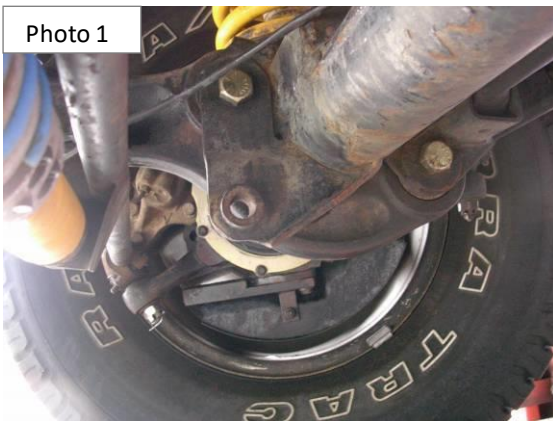
Photo 1 – Removal of the trailing arms can be performed with the vehicle at ride height and on the ground as long as only one trailing arm is removed at a time. A bottle jack may be used to stop the differential from twisting.

Check wheel alignment before starting and record the castor settings