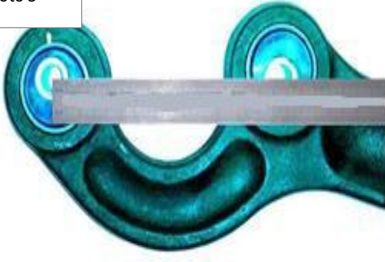
Photo 3 – Press the new offset bushings into the arms, aligning the centre of the tubes in the bushings with the template supplied.

Note: Check that the distance between the hole centres is 189mm, as recommended by the template. This will ensure ease of refitting.